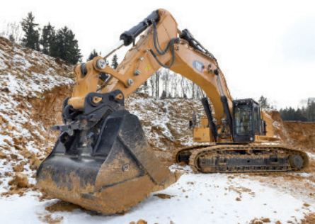
3. Connect front axle.