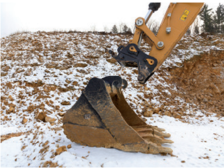
1. Line up.