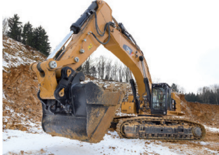
4. Locking the wedge.