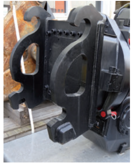
Mounting Brackets for Hydro-Mechanical Tools

Loose CW coupler hinges to retrofit buckets and hydro-mechanical Work Tools are available.