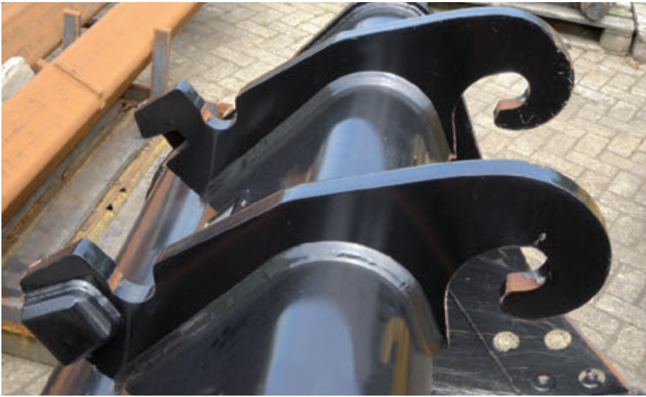
Fixed Quick Coupler hinges on Buckets

In order to fit a work tool to an excavator equipped with a CW coupler, the work tool must have CW-hinges or a dedicated mounting bracket. Fixed CW coupler hinges are available for buckets and rippers. Mounting Brackets with CW hinges are available for hydro-mechanical work tools, like grapples, multi-processors etc.