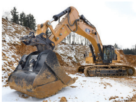
2. Couple rear axle.