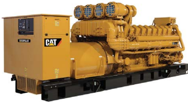
Image shown may not reflect actual package

Standby 3000 kVA 2400 ekW 50 Hz 1500 rpm 400 Volts